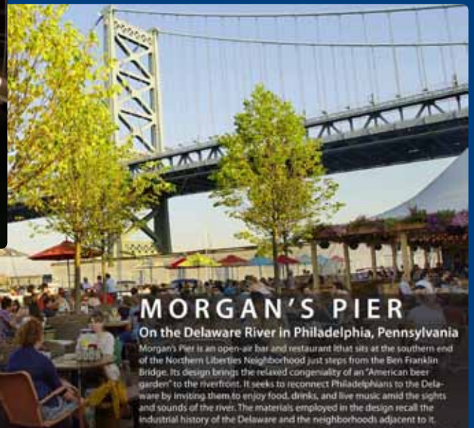
MORGAN'S PIER On the Delaware River in Philadelphia, Pennsylvania

Morgan's Pier is an open-air bar and restaurant that sits at the southern end of the Northern Liberties Neighborhood just steps from the Ben Franklin Bridge. Its design brings the relaxed congeniality of an "American beer garden" to the riverfront. It seeks to reconnect Philadelphians to the Delaware by inviting them to enjoy food, drinks, and live music amid the sights and sounds of the river. The materials employed in the design recall the industrial history of the Delaware and the neighborhoods adjacent to it.