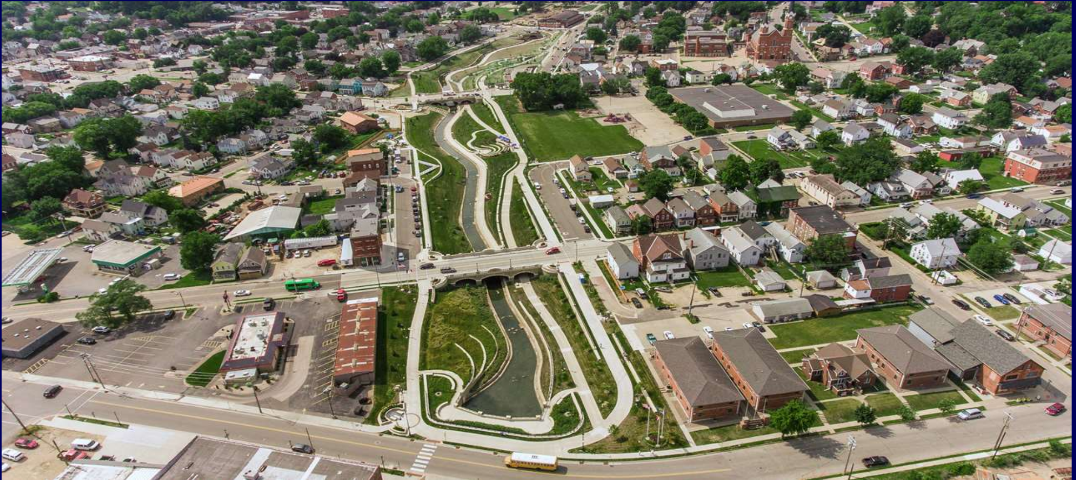
Bee Branch Creek Restoration Project