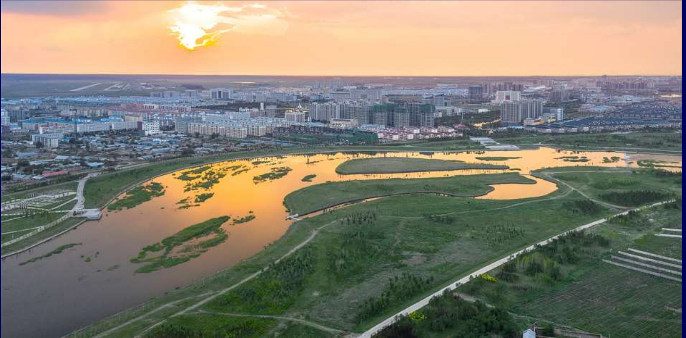
The Yimin River