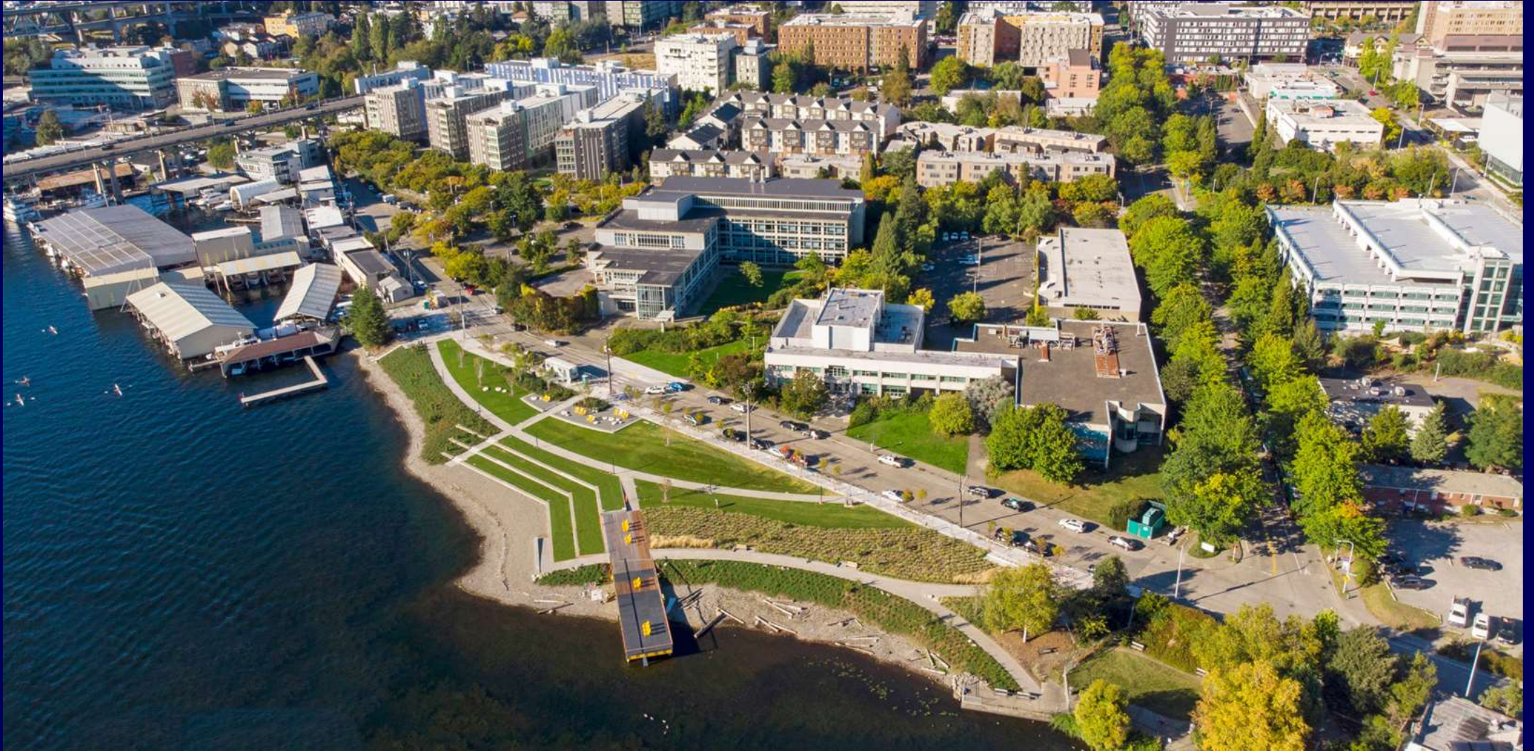
Fritz Hedges Waterway Park