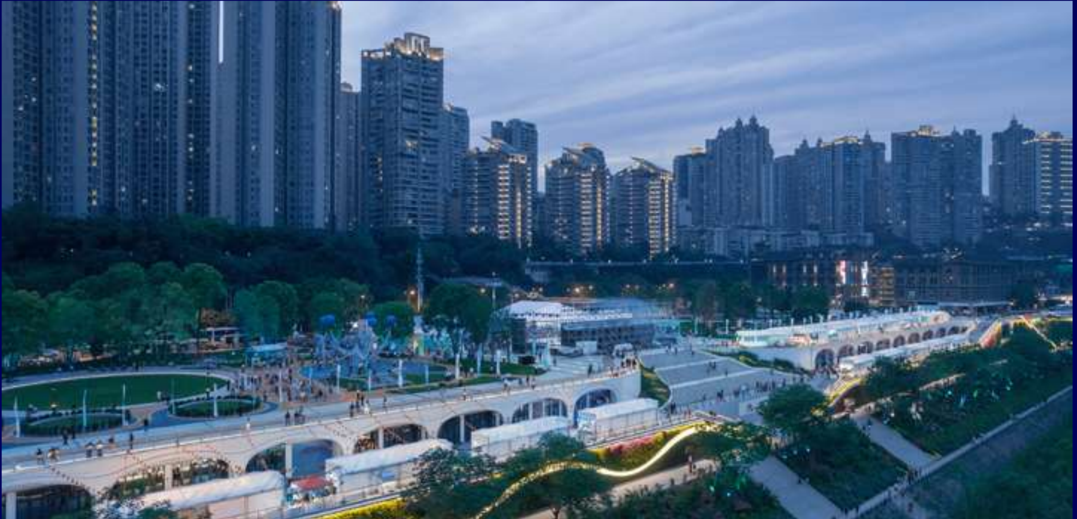
The Yangtze River

Submitted by: MYP Inc. Shanghai China T.Y.Lin International Engineering Consulting(China) Co., Ltd. Chongqing China