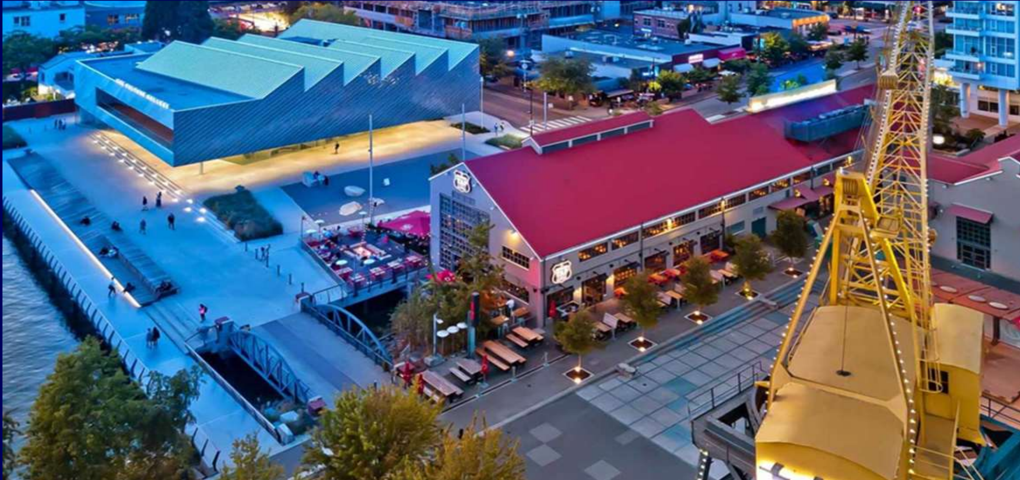
The Shipyards North Vancouver